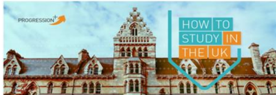
Country study guides